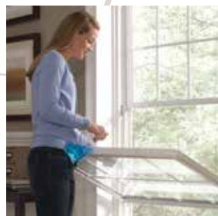
Both sashes of Window World Double-Hung Windows tilt in for easier, safer cleaning from inside your home.

Featuring a beautifully refined silhouette and advanced energy-saving technology, our 4000 Series delivers exceptional style, strength, energy efficiency and value – everything today's homeowners are looking for in a quality replacement window, and more.